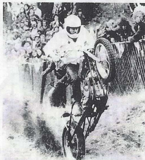
Nitro Burning Triumph 500 Hill-Climber, Orangeville, 1978

I have often wondered why people race given some degree of injury is inevitable eventually. Its fun to watch from the safety of the stands but what are the riders feeling? At a trials in New York State I got talking to a man wearing shorts. I could see his legs were more than a little crooked. He was an old road racer, thus the injuries. We talked about the risks: He said "When you're on the starting grid or take a curve just right, there is no feeling like it. It is an incredible adrenalin rush". He had no regrets and would do it again if his youth could return.